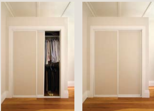
ClimateLine™ offers a smooth finish with outstanding durability.

When you choose to use ClimateLine™ as your Wardrobe Door System panel, you are not only buying a great looking door but piece of mind. Your ClimateLine™ Wardrobe Door System panel is a state of the art Climate™ powder coat finish over quality Gib® board, which means it's tough, easy to clean and benefits the environment.