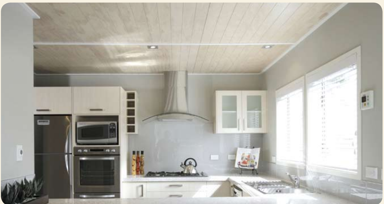
Universal Homes - Blush - V-Groove - Blonde