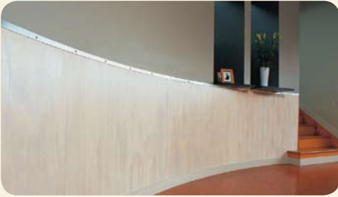
Blush - V-Groove - Blonde