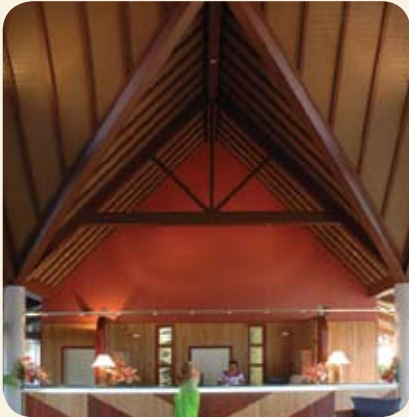
Blush - V-Groove - Ash