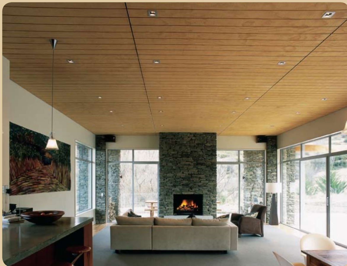
Blush - Rustic Shadowclad - Naturale