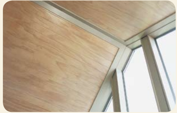
Blush - V-Groove - Naturele