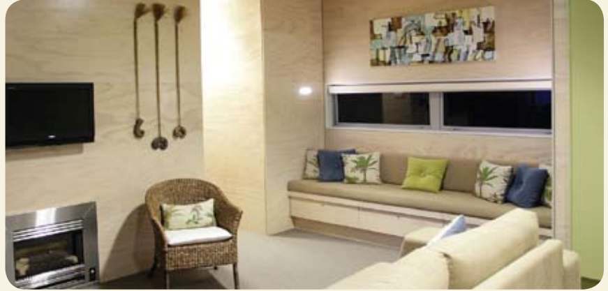
Blush - Smooth Face - Blonde